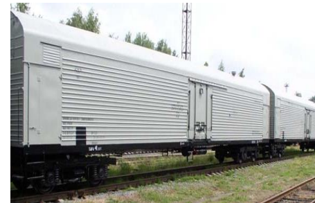
Refrigeration train model Dessau