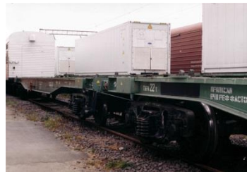
Platform model 13-9004