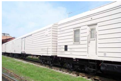
Refrigeration train model BMZ